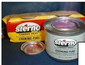
Canned Heat (Sterno, Gel, etc.)