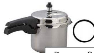
Pressure Cooker & Extra Gasket

An excellent website about pressure cookers is http://missvickie.com Start with the Beginner's Workshop